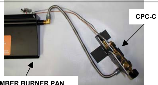
Fig. 1 DO NOT INSTALL CPC-C BEHIND THE EMBER BURNER PAN IN THE FIREPLACE. CPC-C MAY OVERHEAT. FOR BEST RESULT PARELLEL WITH THE WALL OF THE FIREBOX.

WARNING: Warranty is void if the CPC-C is installed behind the burner pan in the fireplace. (Fig. 1)